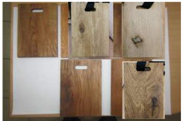
Table made from nature wood with knots and cracks. Can't have holes and shards on the edge